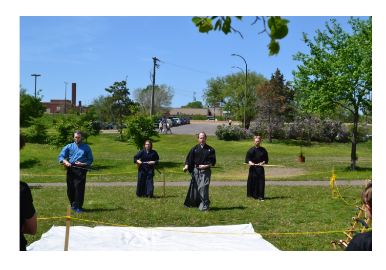
Mutokai Iaido & Minneapolis Jo giving a Japanese Sword demonstration