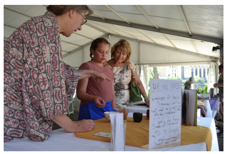
Visitors doing origami at the Chai-Ami Japanese Cultural Center table; visitors learning about tea ceremonies.