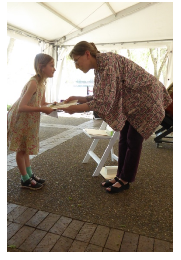
Haiku Contest winners receiving their certificates and gift from Ibaraki.